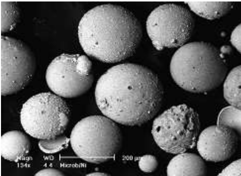
Fig. 1. Nickel coated microspheres

These coated microspheres can be pressed or forged into light weight structures or substrates. Parts formed using our microspheres are durable and machinable. For best results, the powders should be added to other matrix materials (Mg, Al, Ni, Ti, Fe, etc.) in volumes of 10-40% depending upon the properties desired.